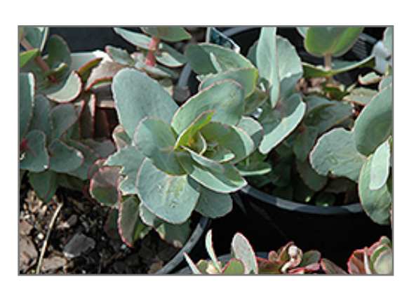
Hab Gray Stonecrop foliage

A colorful stonecrop with blue-green foliage edged in pink; creamy yellow flowers in late summer; a drought-tolerant perennial that does best in poor soils, an excellent choice for late summer color in the garden border