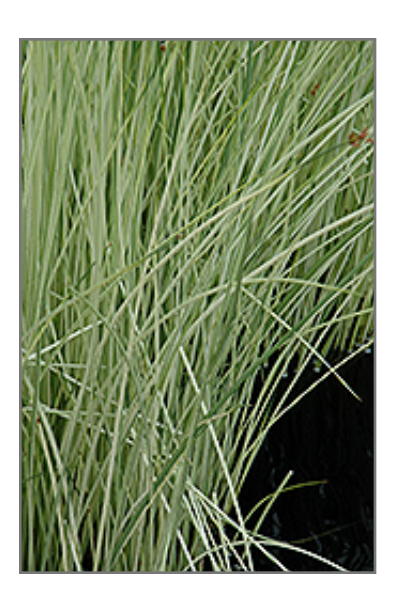
White Rush foliage