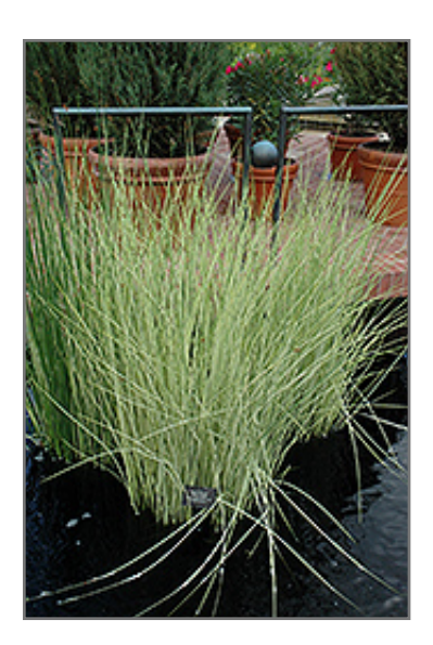
White Rush flowers