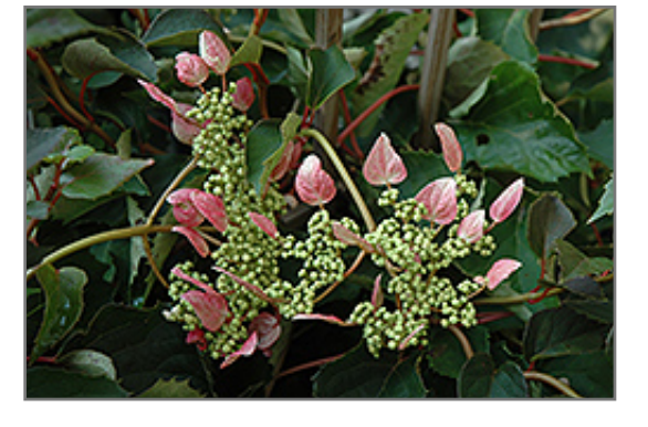
Rosea Hydrangea Vine flowers

Rosea Hydrangea Vine is smothered in stunning cymes of fragrant creamy white flowers with rose bracts along the branches from early to mid summer. It has attractive dark green deciduous foliage. The serrated heart-shaped leaves are highly ornamental and turn yellow in fall. The peeling brown bark adds an interesting dimension to the landscape.