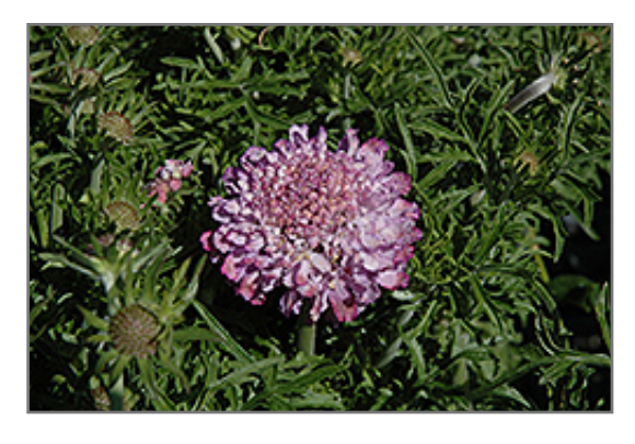
Harlequin Blue Pincushion Flower flowers