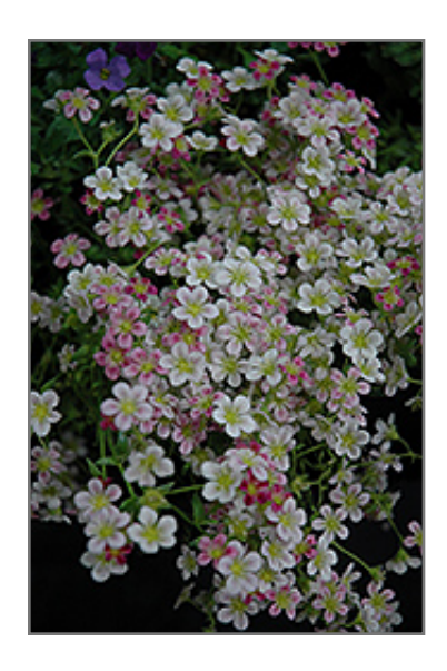
Touran Neon Rose Saxifrage flowers