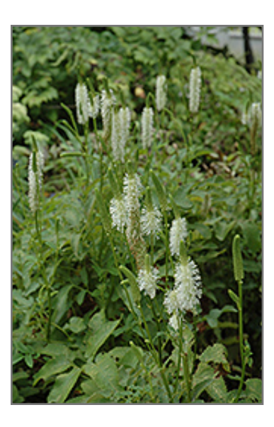
Canadian Burnet flowers

A clump forming wetland plant producing white bottlebrush-like flowers thru summer that are ideal for cutting, held atop attractive compound leaves; a pretty addition to the garden, or near water features