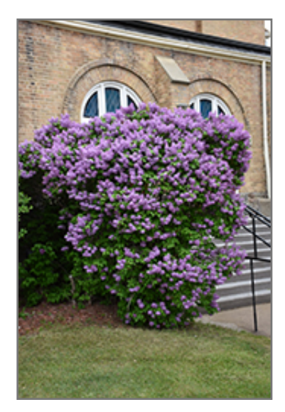
Pocahontas Lilac in bloom