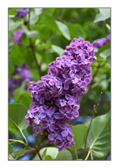
Pocahontas Lilac flowers

Pocahontas Lilac is recommended for the following landscape applications;