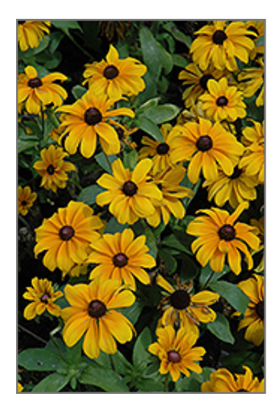
Tiger Eye Gold Coneflower flowers

Tiger Eye Gold Coneflower is an herbaceous perennial with an upright spreading habit of growth. Its medium texture blends into the garden, but can always be balanced by a couple of finer or coarser plants for an effective composition.