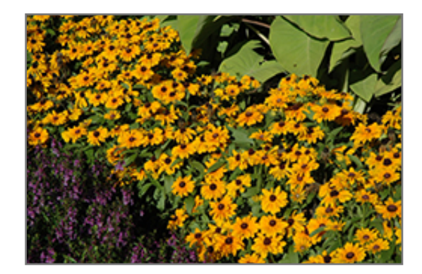
Tiger Eye Gold Coneflower in bloom

This is a relatively low maintenance plant, and should be cut back in late fall in preparation for winter. It is a good choice for attracting butterflies to your yard, but is not particularly attractive to deer who tend to leave it alone in favor of tastier treats. It has no significant negative characteristics.