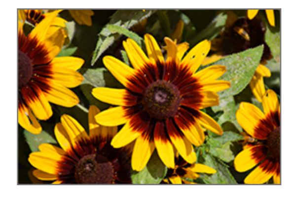
Sonora Coneflower flowers

Sonora Coneflower is recommended for the following landscape applications;