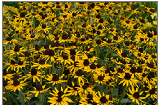
Little Goldstar Coneflower flowers