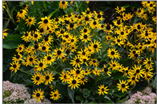
Little Goldstar Coneflower in bloom

This is a relatively low maintenance plant, and should be cut back in late fall in preparation for winter. It is a good choice for attracting butterflies to your yard, but is not particularly attractive to deer who tend to leave it alone in favor of tastier treats. It has no significant negative characteristics.