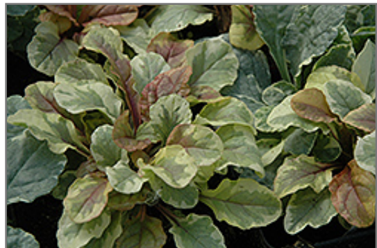
Golden Glow Bugleweed foliage