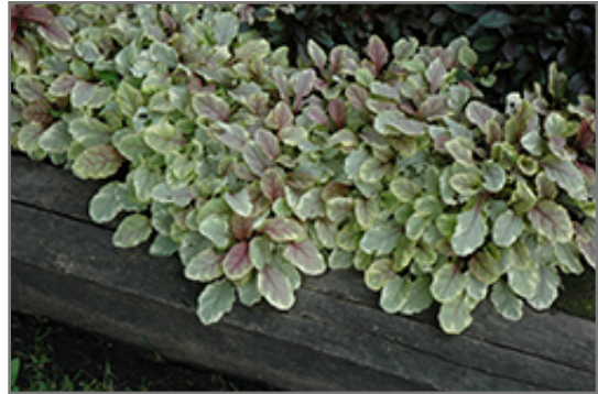
Golden Glow Bugleweed

Golden Glow Bugleweed is recommended for the following landscape applications;