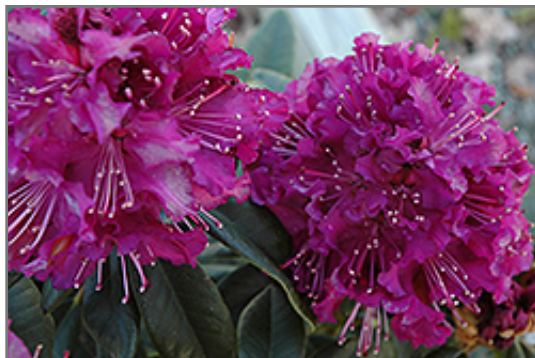
Purpureum Grandiflorum Rhododendron flowers

Purpureum Grandiflorum Rhododendron will grow to be about 8 feet tall at maturity, with a spread of 8 feet. It tends to be a little leggy, with a typical clearance of 1 foot from the ground, and is suitable for planting under power lines. It grows at a slow rate, and under ideal conditions can be expected to live for 40 years or more.