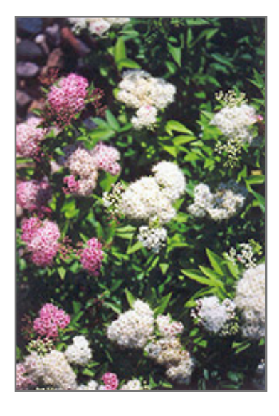
Shirobana Spirea flowers

This shrub will require occasional maintenance and upkeep, and is best pruned in late winter once the threat of extreme cold has passed. It is a good choice for attracting butterflies to your yard, but is not particularly attractive to deer who tend to leave it alone in favor of tastier treats. It has no significant negative characteristics.