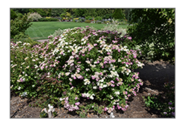
Shirobana Spirea in bloom

Shirobana Spirea is recommended for the following landscape applications;