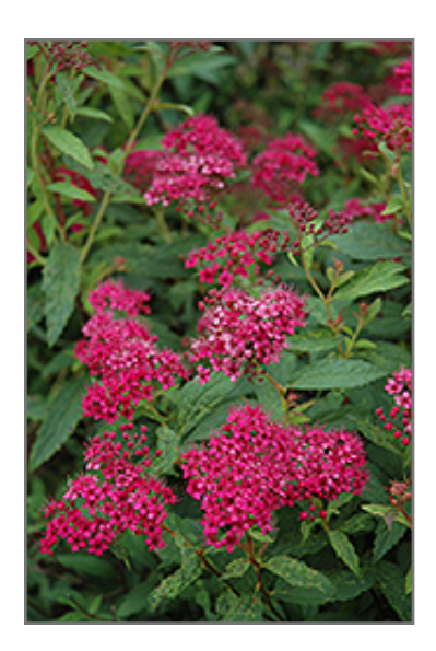
Neon Flash Spirea flowers

Neon Flash Spirea will grow to be about 3 feet tall at maturity, with a spread of 4 feet. It tends to fill out right to the ground and therefore doesn't necessarily require facer plants in front. It grows at a fast rate, and under ideal conditions can be expected to live for approximately 20 years.