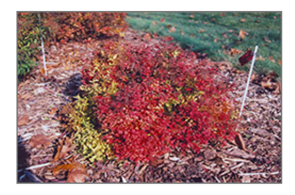
Dakota Goldcharm Spirea in fall

This shrub should only be grown in full sunlight. It prefers to grow in average to moist conditions, and shouldn't be allowed to dry out. It is not particular as to soil type or pH. It is highly tolerant of urban pollution and will even thrive in inner city environments. This is a selected variety of a species not originally from North America.