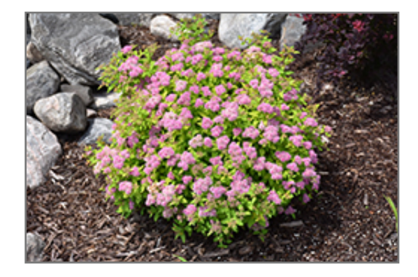
Dakota Goldcharm Spirea in bloom