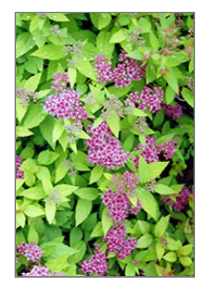
Dakota Goldcharm Spirea flowers

Dakota Goldcharm Spirea is recommended for the following landscape applications;