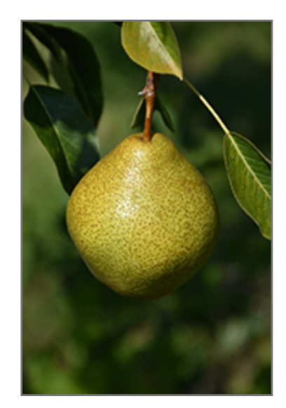
Highland Pear fruit

Highland Pear is bathed in stunning clusters of white flowers with gold eyes along the branches in early spring. It has forest green deciduous foliage. The glossy pointy leaves turn an outstanding deep purple in the fall. The fruits are showy yellow pears with a tan blush, which are carried in abundance in early fall. The fruit can be messy if allowed to drop on the lawn or walkways, and may require occasional clean-up.