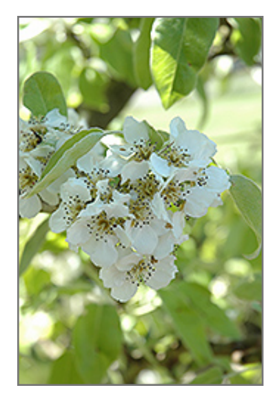
Highland Pear flowers