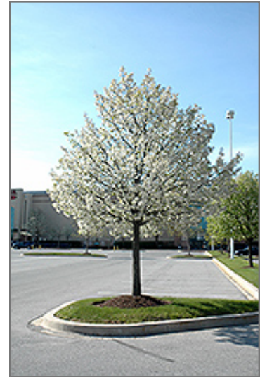
Jack Ornamental Pear in bloom