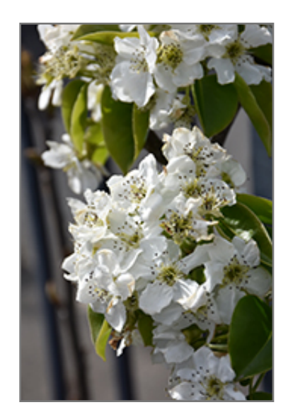
Hosui Asian Pear flowers