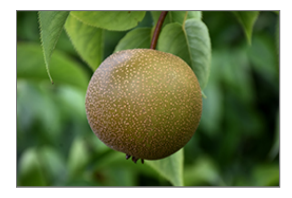
Hosui Asian Pear fruit

Hosui Asian Pear is clothed in stunning clusters of white flowers along the branches in early spring before the leaves. It has dark green deciduous foliage which emerges coppery-bronze in spring. The glossy pointy leaves turn an outstanding red in the fall. The fruits are showy gold pears with orange overtones, which are carried in abundance in late summer. The fruit can be messy if allowed to drop on the lawn or walkways, and may require occasional clean-up.