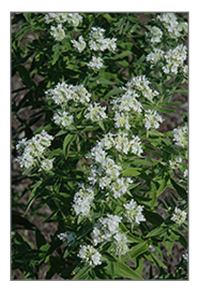
Hairy Mountain Mint in bloom