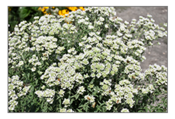
Hairy Mountain Mint flowers

Hairy Mountain Mint is recommended for the following landscape applications;