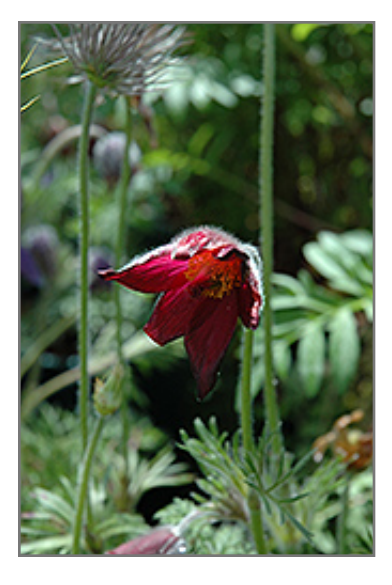
Heiler Hybrids Pasqueflower flowers

Early blooming rock garden plants producing a variety of bloom colors, including shades of red, lavender, purple, and white, that are held closely over mounds of feathery leaves; suitable for rockeries and dry gardens