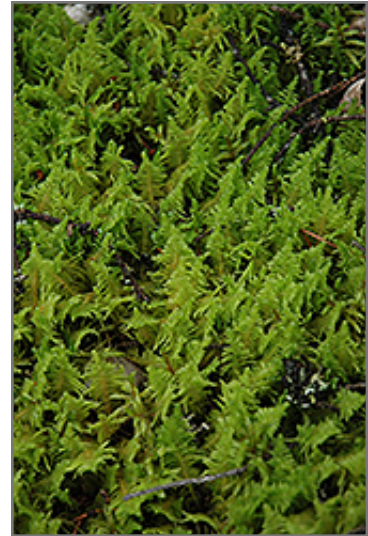
Plume Moss