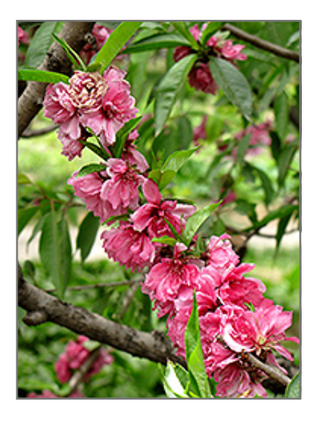
Rubroplena Flowering Peach flowers

Rubroplena Flowering Peach features showy clusters of fragrant double rose flowers along the branches in early spring, which emerge from distinctive red flower buds before the leaves. It has dark green deciduous foliage. The narrow leaves turn yellow in fall.