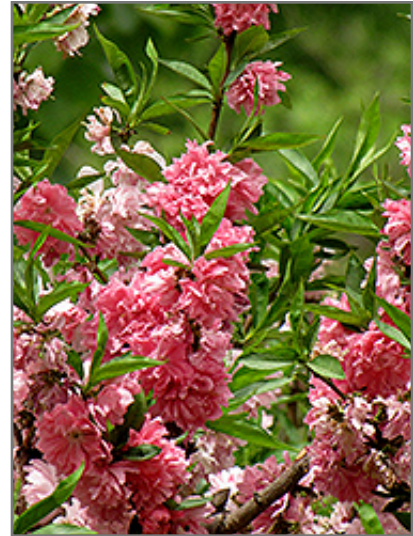
Klara Meyer Flowering Peach flowers