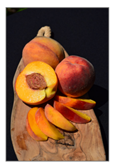
Elberta Peach fruit and flesh