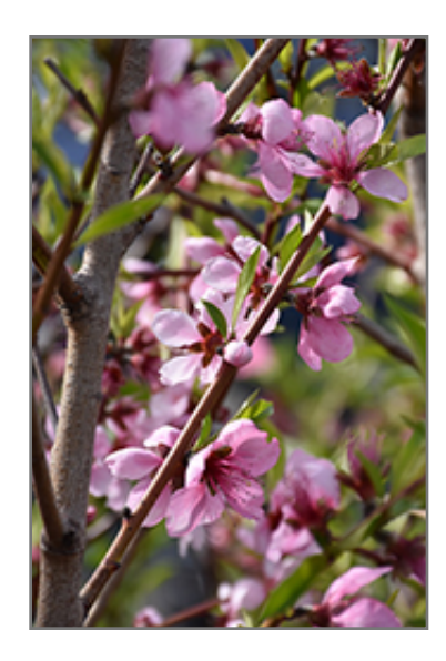
Elberta Peach flowers