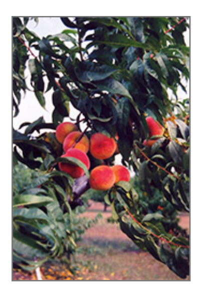
Baby Gold Peach fruit

Baby Gold Peach is smothered in stunning clusters of fragrant shell pink flowers along the branches in early spring, which emerge from distinctive rose flower buds before the leaves. It has dark green deciduous foliage. The narrow leaves turn yellow in fall. The fruits are showy gold drupes with a scarlet blush, which are carried in abundance in mid summer. The fruit can be messy if allowed to drop on the lawn or walkways, and may require occasional clean-up.