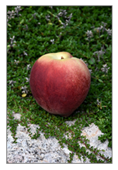
Babcock Peach fruit