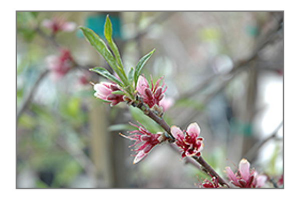
Babcock Peach flowers