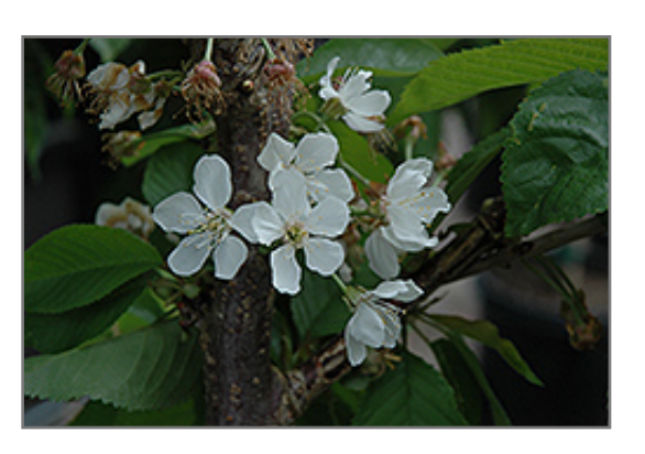
Rainier Cherry flowers