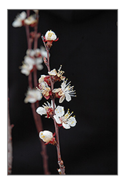
Chinese Apricot flowers