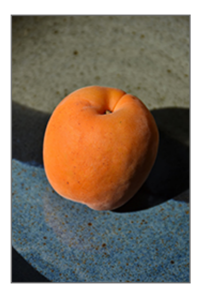
Chinese Apricot fruit

Chinese Apricot is blanketed in stunning clusters of fragrant white flowers along the branches in early spring before the leaves. It has green deciduous foliage. The pointy leaves turn yellow in fall. The fruits are showy yellow drupes with a orange blush, which are carried in abundance in late summer. The fruit can be messy if allowed to drop on the lawn or walkways, and may require occasional clean-up.