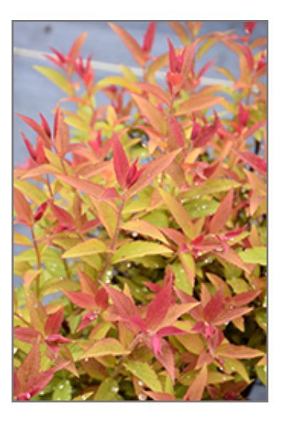
Froebelii Spirea foliage

This shrub should only be grown in full sunlight. It prefers to grow in average to moist conditions, and shouldn't be allowed to dry out. It is not particular as to soil type or pH. It is highly tolerant of urban pollution and will even thrive in inner city environments. This particular variety is an interspecific hybrid.