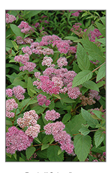
Froebelii Spirea flowers

This shrub will require occasional maintenance and upkeep, and is best pruned in late winter once the threat of extreme cold has passed. It is a good choice for attracting butterflies to your yard, but is not particularly attractive to deer who tend to leave it alone in favor of tastier treats. It has no significant negative characteristics.