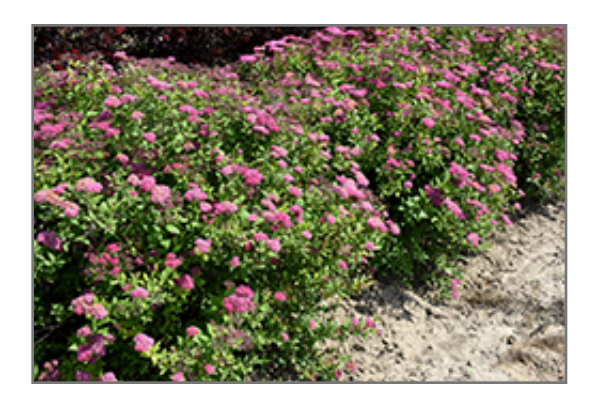
Froebelii Spirea in bloom