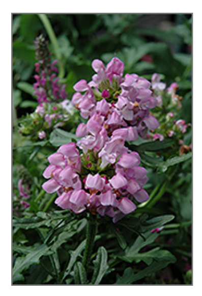
Summer Daze Self Heal flowers

An elegant variety producing masses of terminal clusters of stunning pink flowers in late spring, then continues until fall; excellent as a groundcover, edging, or container planting; tolerates a wide range of soils