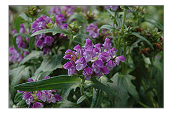
Freelander Blue Self Heal flowers