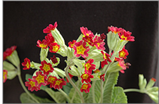
Sunset Shades Cowslip flowers