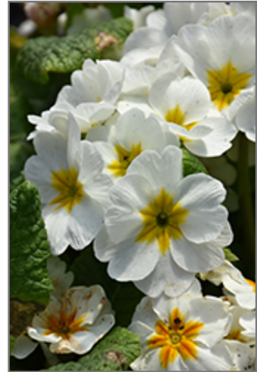
Supernova White Primrose flowers