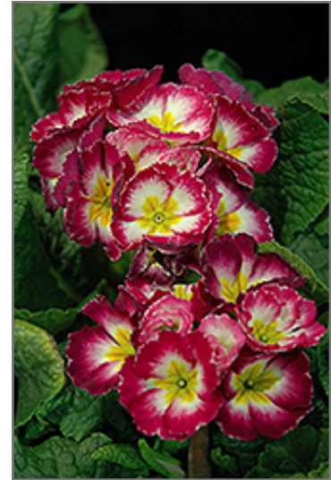
Supernova Rose Bicolor Primrose flowers