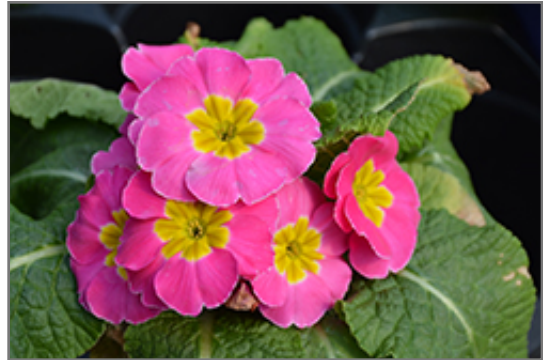
Supernova Pink Primrose flowers