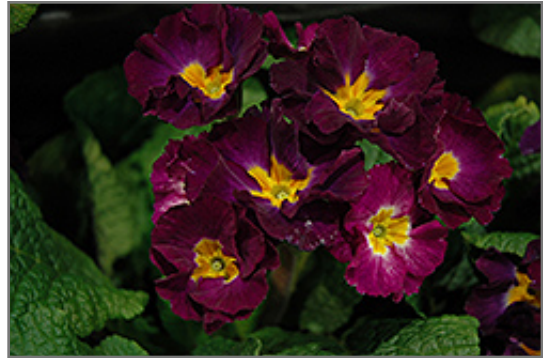
Supernova Magenta Primrose flowers