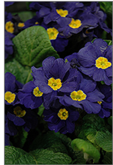
Supernova Blue Primrose flowers