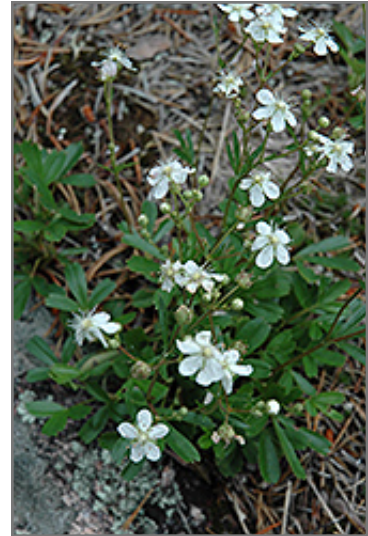
Three Toothed Potentilla flowers

Three Toothed Potentilla is recommended for the following landscape applications;