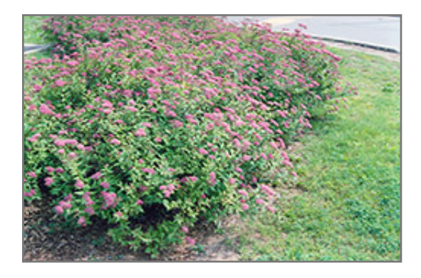
Dart's Red Spirea in bloom