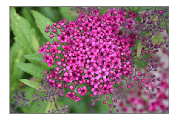
Dart's Red Spirea flowers