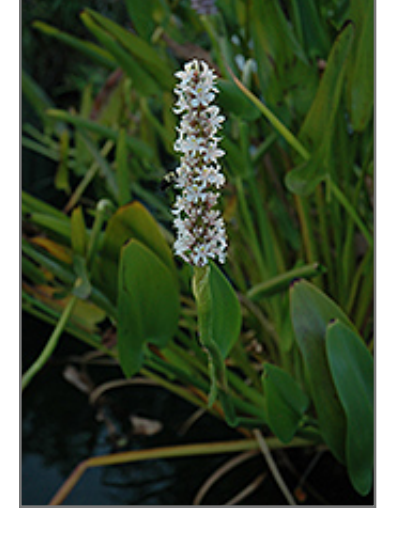
White Pickerelweed flowers

A common plant in native wetlands; beautiful spikes of white flowers from late spring through summer; perfect for the margins of garden ponds or constantly moist areas; established plants can thrive in flooded areas; spreads by creeping rhizomes