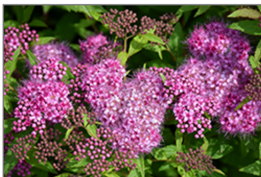
Anthony Waterer Spirea flowers