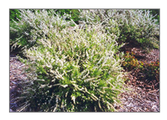
Dwarf Garland Spirea in bloom

A compact ball-shaped shrub featuring gracefully arching branches smothered in striking snow-white flowers in spring, keeps tidy the rest of the year, low maintenance; beautiful in a small garden or shrub border; full sun and well-drained soil