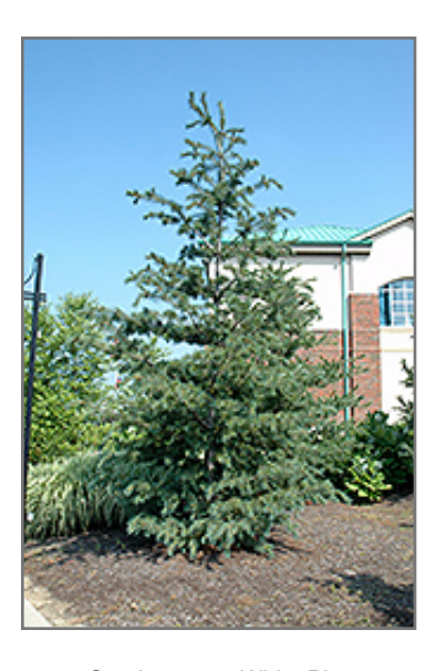
Southwestern White Pine

Southwestern White Pine is primarily valued in the landscape for its distinctively pyramidal habit of growth. It has grayish green evergreen foliage. The needles remain grayish green throughout the winter. The rough dark gray bark adds an interesting dimension to the landscape.