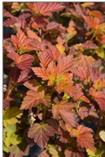
Amber Jubilee Ninebark foliage

This shrub will require occasional maintenance and upkeep, and can be pruned at anytime. It has no significant negative characteristics.