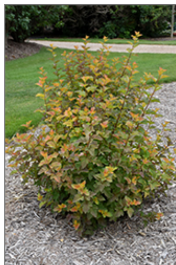
Amber Jubilee Ninebark