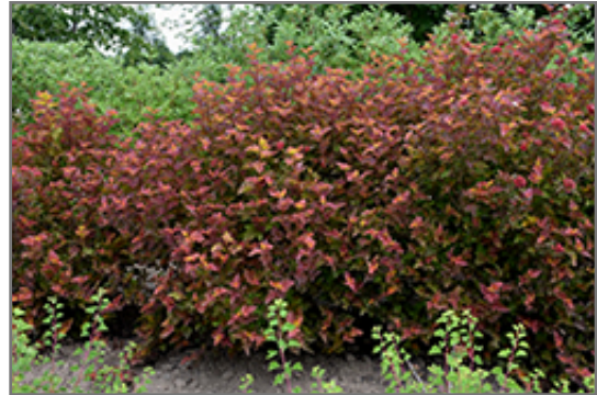
Amber Jubilee Ninebark

This shrub does best in full sun to partial shade. It is very adaptable to both dry and moist locations, and should do just fine under average home landscape conditions. It is not particular as to soil type or pH. It is highly tolerant of urban pollution and will even thrive in inner city environments. This is a selection of a native North American species.