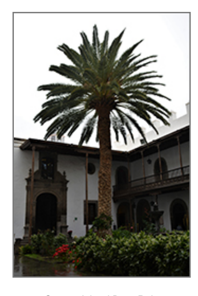
Canary Island Date Palm

This tropical plant does best in full sun to partial shade. It does best in average to evenly moist conditions, but will not tolerate standing water. It is not particular as to soil type or pH. It is somewhat tolerant of urban pollution. This species is not originally from North America.