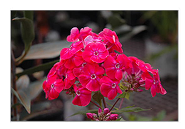
Party Punch Garden Phlox flowers