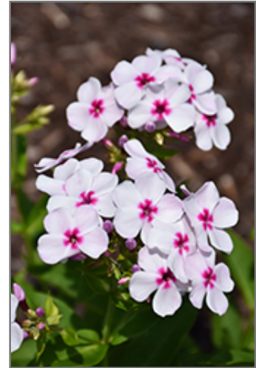
Flame White Eye Garden Phlox flowers

Flame White Eye Garden Phlox will grow to be about 16 inches tall at maturity, with a spread of 18 inches. When grown in masses or used as a bedding plant, individual plants should be spaced approximately 15 inches apart. It grows at a medium rate, and under ideal conditions can be expected to live for approximately 10 years. As an herbaceous perennial, this plant will usually die back to the crown each winter, and will regrow from the base each spring. Be careful not to disturb the crown in late winter when it may not be readily seen!