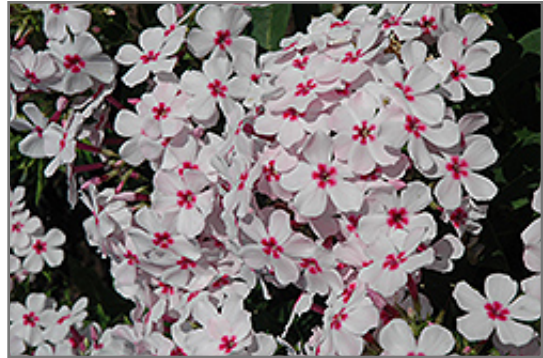
Flame White Eye Garden Phlox flowers

This plant will require occasional maintenance and upkeep, and should be cut back in late fall in preparation for winter. It is a good choice for attracting butterflies and hummingbirds to your yard. Gardeners should be aware of the following characteristic(s) that may warrant special consideration;