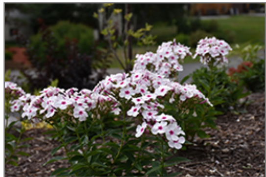
Flame White Eye Garden Phlox in bloom