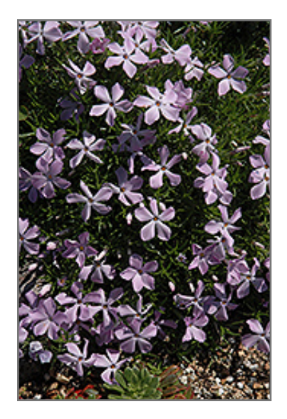
Spreading Phlox

Very horizontal, spreading plants with small clusters of rounded violet flowers with a gold eye; very eye-catching, ideal for alpine and xeriscape applications