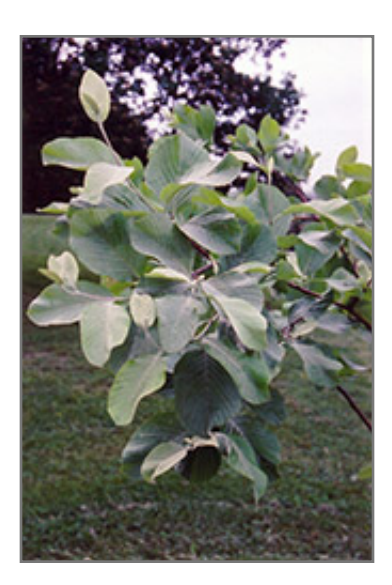
Silver Leaf Mountain Ash foliage