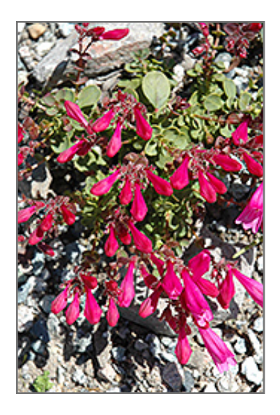
Cliff Beard Tongue flowers